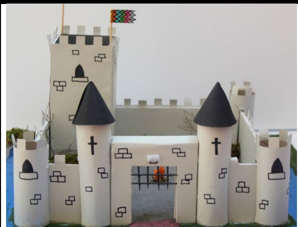
RECYCLABLE MATERIALS (ie. paper towel rolls, styrofoam, cardboard, etc.)

IF YOU CHOOSE TO PARTICIPATE, PLEASE BRING YOUR ICE CASTLE TO SCHOOL ON WEDNESDAY, FEBRUARY 5th, TO BE PUT ON DISPLAY FOR ALL STAFF & STUDENTS TO SEE.